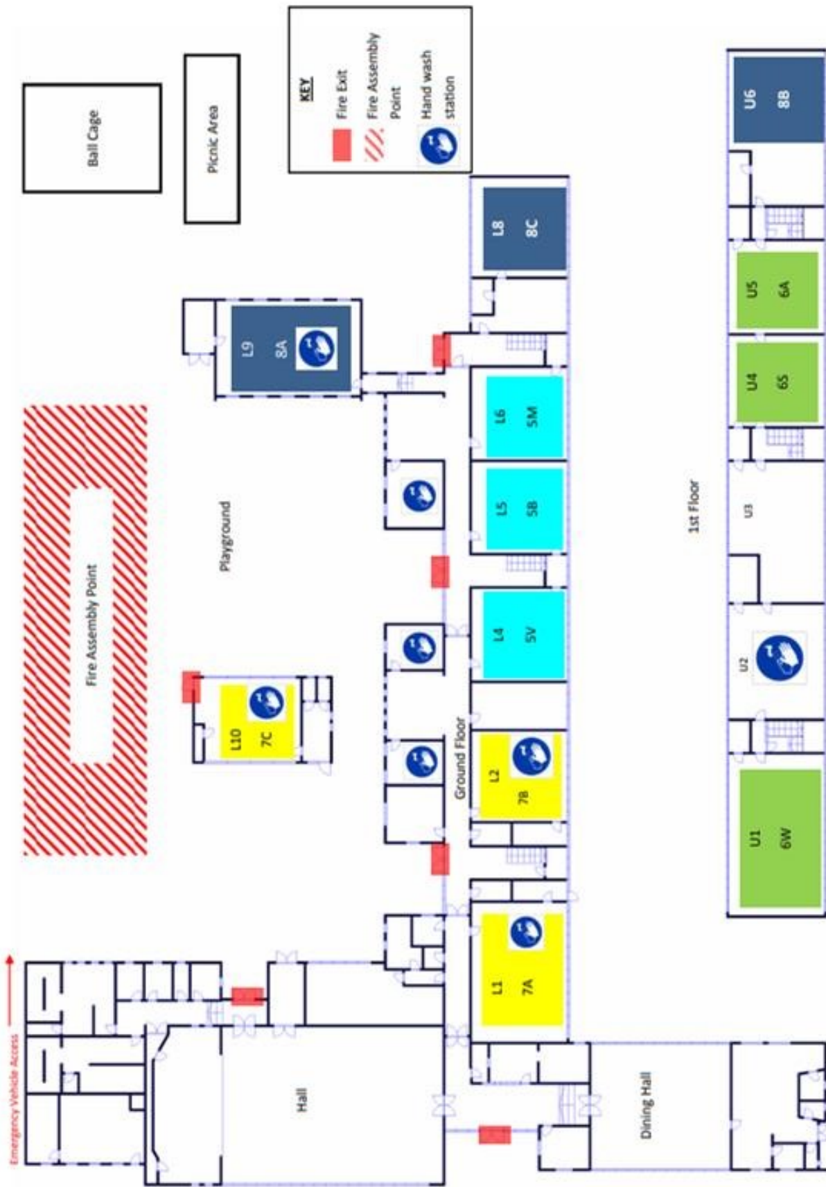
Corbridge Middle School Plan: Fire Evacuation, Assembly Point & Class Bases