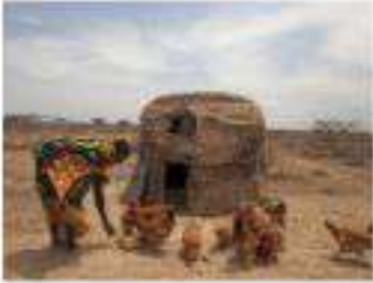
A pair of chickens