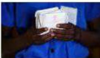
Period kit £12.00