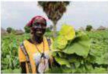
Seeds of hope and tools of change