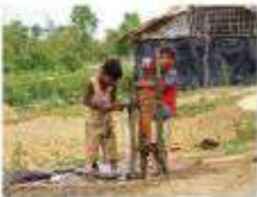
Clean water £30.00